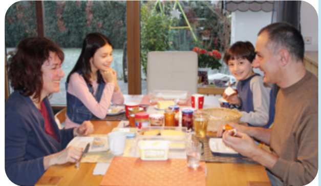
Important for health and wellbeing: one common family meal per day.

We look forward to cooperating with you.